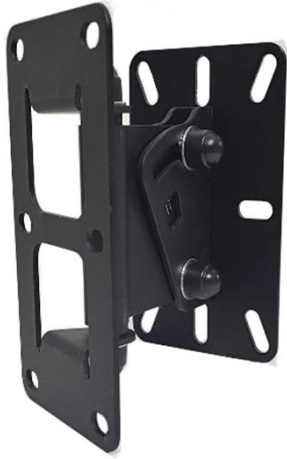
Rotatable bracket with vertical and horizontal